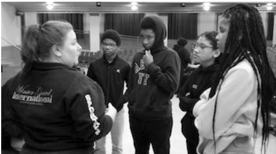
Attentive Tigers listen to direction before taking to the stage for 2020 Sounds of Withrow rehearsals.