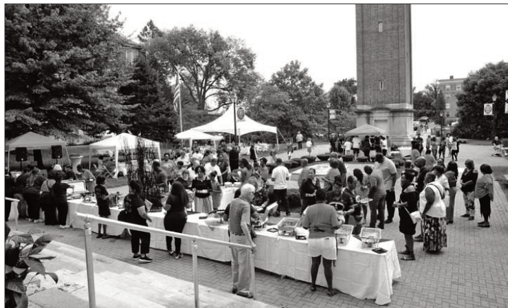
Left, the Golf tournament committee planned a tournament that raised money for scholarships. Right, alumni enjoyed Sunday brunch around the tower.