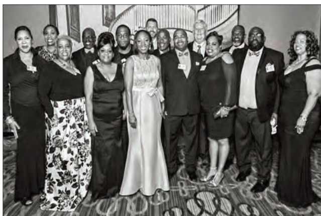
The gala committee delivered a spectacular evening.

After two years of organization, meeting, planning, and execution, the Withrow Centennial Celebration took place from September 4 through September 8, 2019. Presented by the Withrow Alumni Association, the five-day celebration marked our 100 years of providing excellence in educational, civic, musical and athletic accomplishments. Additionally,